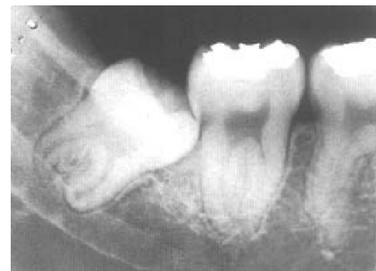
FIGURE 1—A mesioangular impaction, with the roots in close proximity to or saddling the mandibular canal containing the mandibular nerve.

When fully formed, the roots frequently lie close to the right and left mandibular nerves, which run along the jaw beneath or between the roots. The risk of permanent paresthesia following extraction of a mesioangular impaction is as high as 6.8%, much higher than for other types of unerupted or impacted teeth. 6 More than 95% of these teeth will never cause any problem. As many as